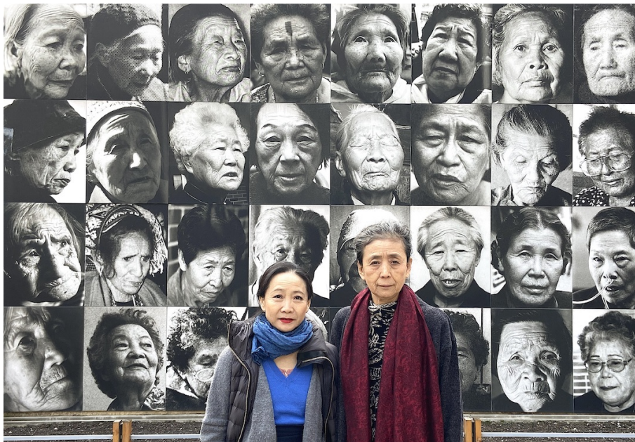
Video still from No Rule Is Our Rule