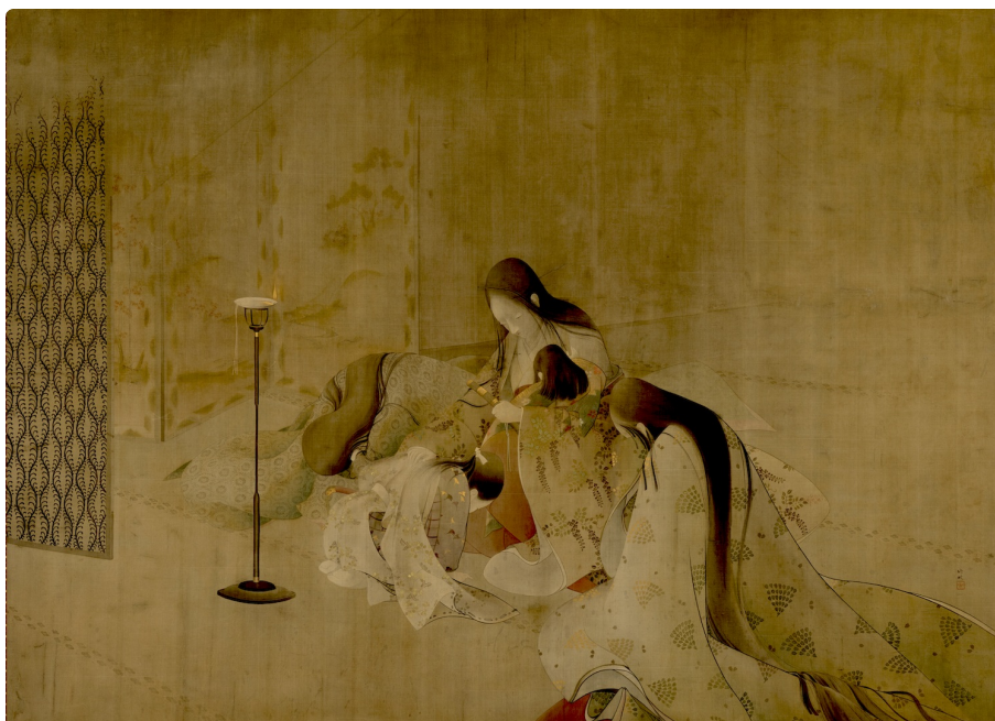
Fall of the Castle (1902) by Otake Chikuha