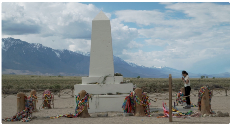
Video stills from Visiting Manzanar (2019)

A friend told me that the footage shot at Manzanar, where people of Japanese ancestry were interned during the World War II, made her and others remember that a wartime internment camp exists not far from Phoenix, and awful scenes continue to repeat in the U.S. and other borders.