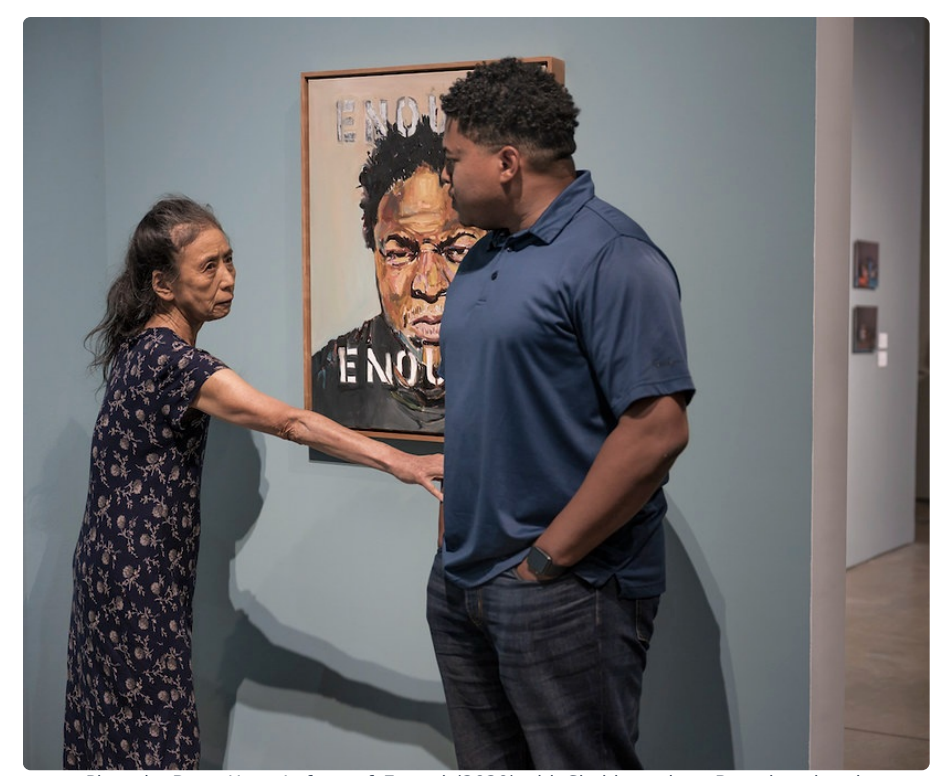
Photo by Betty Hum. In front of Enough (2020) with Sheldon, whom Beverly painted.

Ishmael and I performed solos responding to particular paintings we chose. We also danced our duet in front of Loving of Black and White 3, 5, and Invisible me.