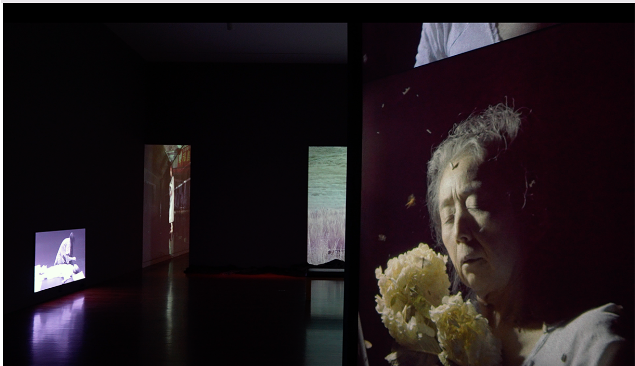
A view of works in the darkened gallery space in Eiko Otake's exhibition I Invited Myself, vol. II at the Colorado Springs Fine Arts Center.

Performance art and dance occupy a strange sector in institutional art spaces. The form largely exists in their documentation. “Marina Abramovich comes from the white box, whereas I come from the black box,” Otake said to me recently. While “white cube” performances translate more readily into museums, those in the “black box”—a smaller setting meant for a more intimate experience—take a little more entrepreneurial savvy to manifest. [2]