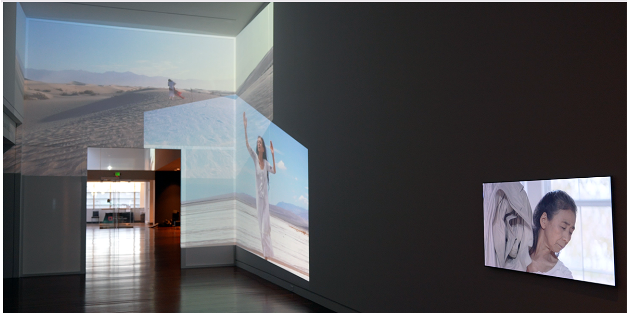
A view of Eiko Otake's exhibition I Invited Myself, vol. II at the Colorado Springs Fine Arts Center.

To see the work of Eiko Otake is to become acutely aware of raw emotions that are universally felt but uniquely experienced. Watching her movements in space is like being conscious of your own pulse—the moments when it races, slows, or becomes almost undetectable. Her work dwells meaningfully in the territory of what it is to be alive and what it is to be moving around and towards death.