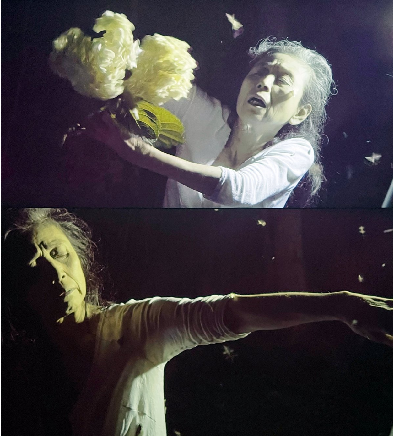
A video still from Eiko Otake's Night with Moths , 2019.

While the pieces in the exhibition span decades, Otake would not refer to them as an archive or a retrospective. As she describes the show, it re-imagines her work activated through live performance: