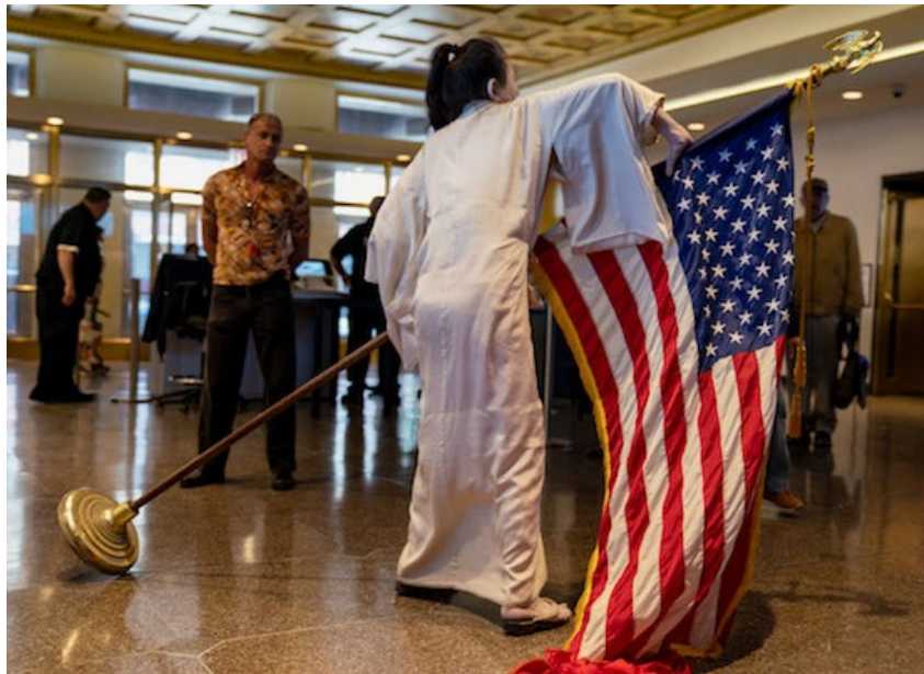
of Eiko at the 92Y