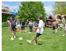
Students Celebrate the End of the Semester with Spring Thing