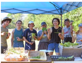
Students Begin Harvesting, Selling Produce at Long Lane Farm