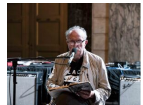
Lucier’s 90th Birthday Celebrated with 90 Artists Recording “I’m Sitting in a Room”