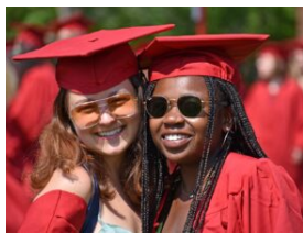
A Pictorial Look at the 189th Commencement Ceremony