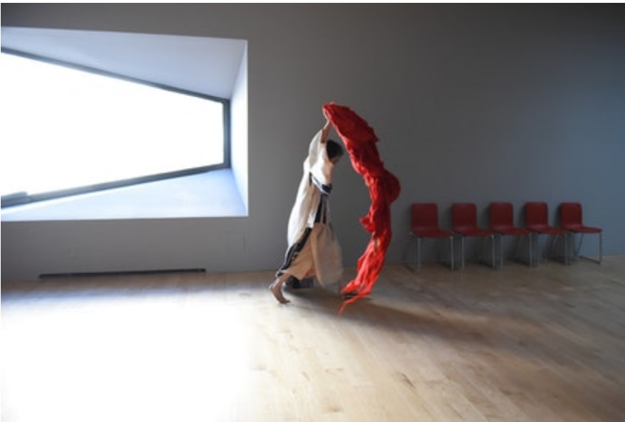
Eiko Otake, A Body In Places , MET Breuer.

Among Performa 17's artists, Xavier Cha, Eiko Otake, and Kelly Nipper all present dance pieces that seem inspired by Dada art; they can be loosely classified as a choreographed collage, a high-tech assemblage, and a multimedia sound poem, respectively. But whether they capture the spirit of Dadaism is more difficult to parse.